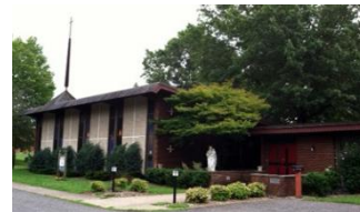
St. Barnabas Chapel 721 Hall Street Bridgeport, WV