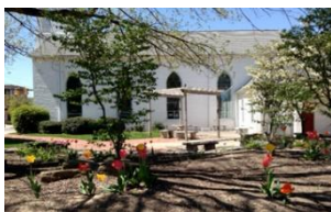
Christ Church Sixth and Main Streets Clarksburg, WV